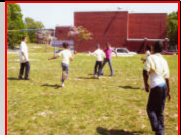
The students at Anne Beers play with the equipment.

The Hillcrest Community Civic Associations' actions are truly appreciated not only by me and the staff but by every student on every grade level. You all have impacted our total program with the extension of your gift giving. It is encouraging to know that neighbors still care about the children of Beers and are willing to invest considerable efforts, funds and time into ensuring that education improves for them on all levels. The Beers family members look forward to our developing relationship and all that will be accomplished as a result. Again, thank you all for your gracious gifts and we anticipate many more future endeavors.