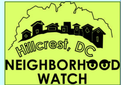
Image on the Hillcrest Neighborhood Watch t-shirt that will be available for sale for $10 on the evening of National Night Out on Aug. 3.

at 6:45 p.m. We will bike to Fairfax Village and patrol the neighborhood ending at Naylor Gardens. All neighbors are encouraged to put on their porch lights; and those not participating in the bike patrol should walk their blocks. This would be an excellent time to exchange phone numbers and email addresses to create your own Dial my call neighborhood list.