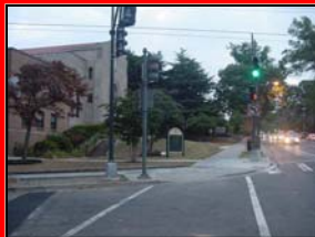
St. Francis Xavier on Pennsylvania Avenue.

Upcoming Retail Forum —The Office of Planning is hosting a Retail Forum on Monday, Nov. 5, 6:30 to 8 p.m. at the St Francis Xavier Catholic Church (Bailey Room) at 2812 Pennsylvania Ave., SE. The forum will focus on the Pennsylvania Avenue, SE, commercial district, and will include a panel discussion on retail opportunities and challenges in the area. The forum will also include a discussion with residents on shopping habits and buying preferences.